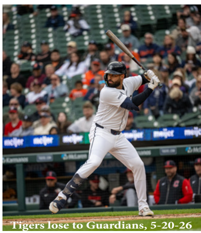
Tigers lose to Guardians, 5-20-26