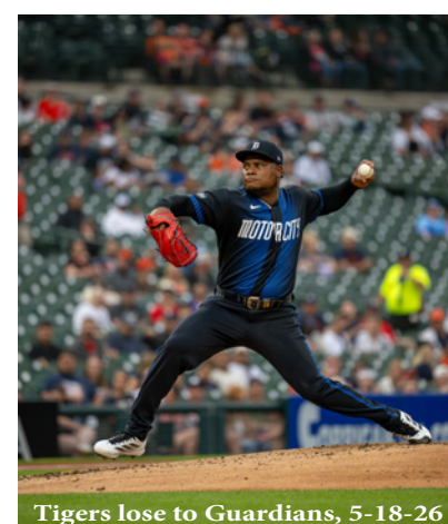
Tigers lose to Guardians, 5-18-26