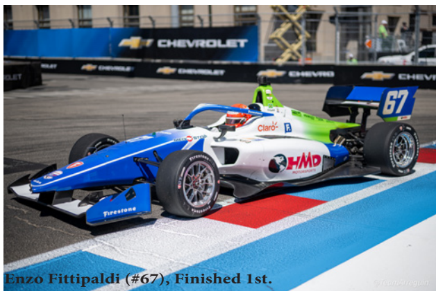
Enzo Fittipaldi (#67), Finished 1st.