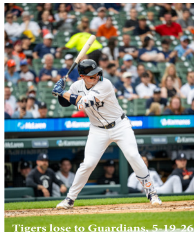
Tigers lose to Guardians, 5-19-26