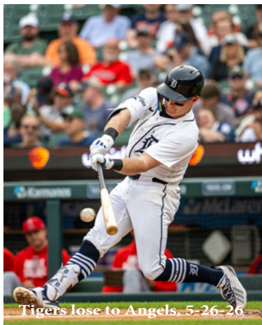
Tigers lose to Angels, 5-26-26