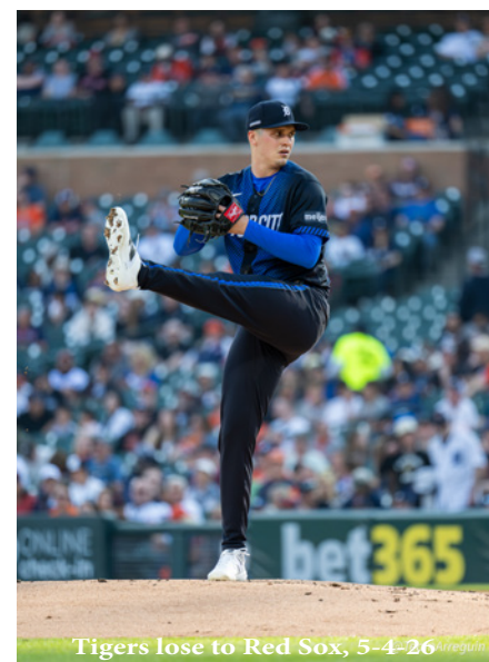
Tigers lose to Red Sox, 5-4-26 reguin